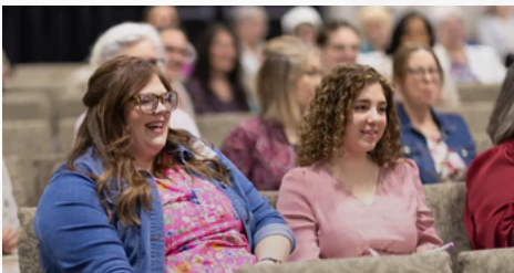
New England Ladies Conference at Calvary Baptist Church of Sanford, ME