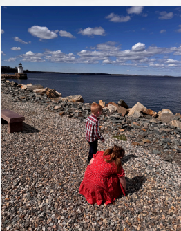
Collecting rocks in Portland!