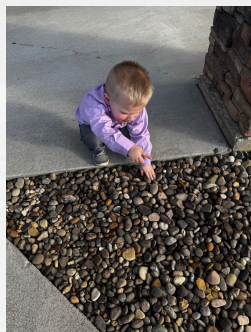
& every possible place we find them