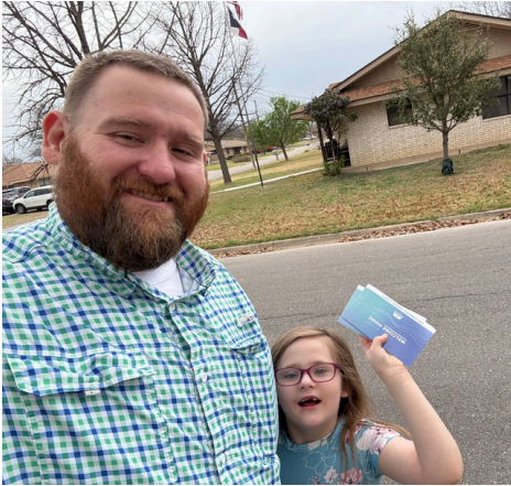
Soulwinning in Texas!