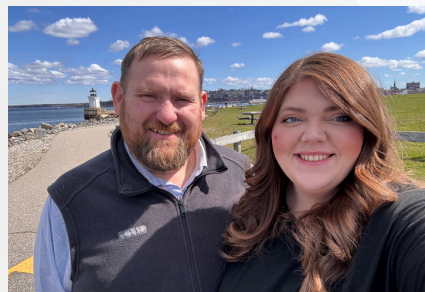
Visiting the Bug Light in South Portland during our time in New England!