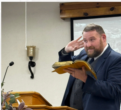
Preaching the Word!